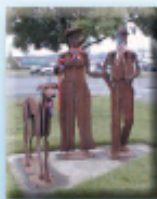
Steel Sculptures in Raymond

Historic logging town and gateway to the beautiful Willapa River and Bay. Access the river and wetlands at the boat ramp and docks. Golf at the picturesque golf course. Library and theater on the National Register of Historic Places. Antique logging equipment. Wildlife and heritage sculptures. Fishing. Canoeing. Seaport and carriage museums.