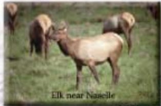
Elk near Naselle

and appreciate the majesty of our county all year long.