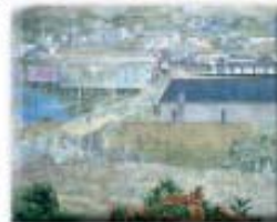
Mural on Pacific County Historical Society Museum, South Bend

Exploring on your own, visit the waterfronts and observe oystermen and fishermen at work. Discover one of the many cranberry and dairy farms located throughout Pacific County. We invite you to come during any of the four seasons to experience our heritage. Pacific County shines even when the sun doesn't!