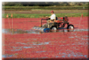
Cranberry harvest near Seaview

Cape Disappointment Lighthouse or a long gentle trail to North Head Lighthouse. The Lewis and Clark Interpretive Center offers a pictorial exhibit of the famous expedition. Black Lake hiking trail. Tourist amenities. Fishing. Camping. Hiking.