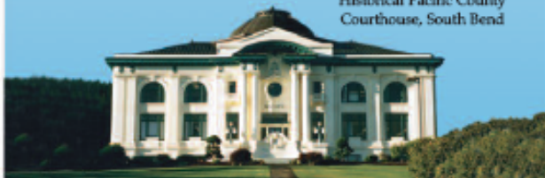
Historical Pacific County Courthouse, South Bend

Riverside fishing village with a rich architectural and cultural heritage. Access water, shops and restaurants near the city dock and boardwalk. Historic Pacific County Courthouse retains original fixtures and lighted Tiffany glass dome 29 feet in diameter. Walking tour of historic buildings. Pacific County Historical Museum. 1890 logging "Steam Donkey." Fishing. Canoeing.