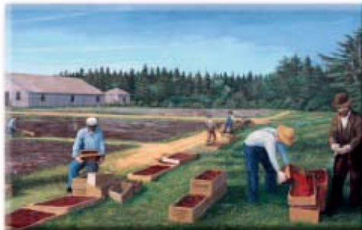
Historic mural in Long Beach

Cranberry Museum, Long Beach Shellfish Interpretive Center, Nahcotta World Kite Museum & Hall of Fame, Long Beach Lewis and Clark Interpretive Center, Cape Disappointment, Ilwaco Columbia Pacific Heritage Museum, Ilwaco Fort Columbia National Historic Site, Chinook Pacific County Historical Society and Museum, South Bend Willapa Seaport Museum, Raymond Northwest Carriage Museum, Raymond