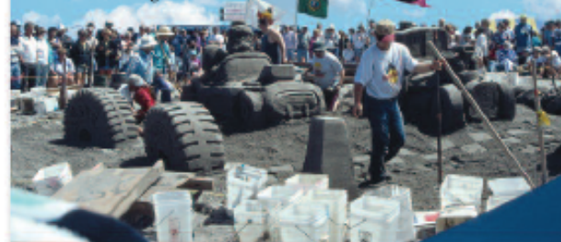
Annual Sandcastle Festival in Long Beach

Turn-of-the-century lively seashore resort featuring 28 miles of uninterrupted beach. Visit the boardwalk, specialty shops, resorts and restaurants. Wood carvings. Jogging. Sunbathing. Horseback riding. Surf fishing. Storm watching. Kite flying. Lewis and Clark Square.