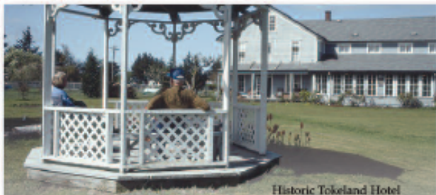
Historic Tokeland Hotel