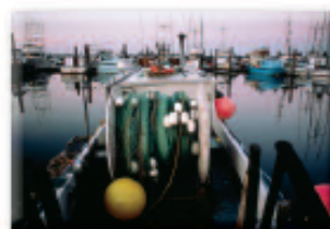
Gillnet boat at Ilwaco

Home to charter, sports and commercial fishing. View exhibits of local history at the Columbia Pacific Heritage Museum. From Cape Disappointment State Park, hike a short steep trail to