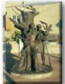
Lewis and Clark Square in Long Beach

Stand where Lewis and Clark stood in November 1805 "in full view of the Ocean" and capture the spirit and adventure of discovery. The Corps of Discovery explored Pacific County for 18 days at the conclusion of their mission set for them by President Thomas Jefferson. View this spectacular region, little-changed from the way Lewis and Clark experienced it nearly 200 years ago.