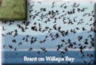
Brant on Willapa Bay