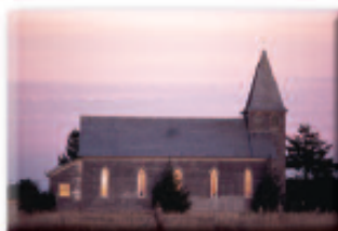
St. Mary's Church near Chinook

Finnish heritage farming community. Walk the beautiful grounds at the Naselle State Salmon Hatchery. Salmon Creek roadside park. Boat ramp. Fishing. Hiking.