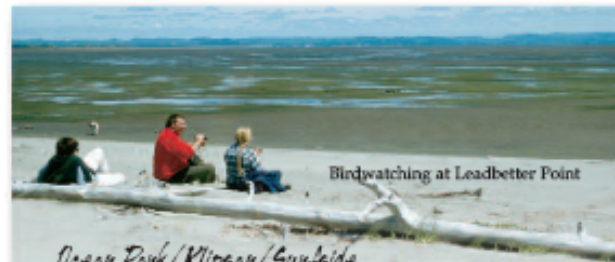
Birdwatching at Leadbetter Point

Quaint resort village. Take the back roads to view turn-of-the-century guest cottages. Paths over the dunes to the beach. Country Inns. Award winning cuisine. Hiking. Beachcombing.