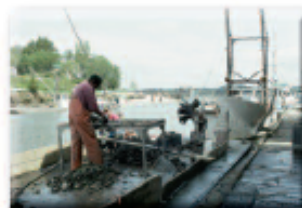
Bay Center oyster barge

Historic fishing village and home of huge oyster beds. Site of oldest settlement in county at nearby Bruceport. Magnificent views of Willapa Bay. County park. Birdwatching. Camping. Beachcombing.