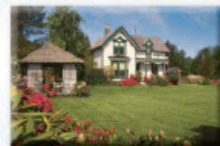
Historic Espy House in Oysterville

Early day resort area complete with old style country store. Stroll through town to view circa 1890's cottages. Remote beaches, wind and grass. Clam digging. Storm watching. Beachcombing.